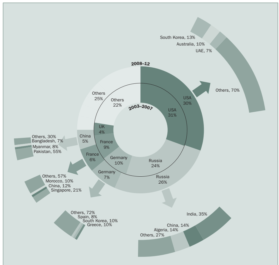
Figure 2. The five largest exporters of major conventional weapons, 2003–2007 and 2008–12, and their main recipient states, 2008–12

The volume of Chinese exports of major conventional weapons rose